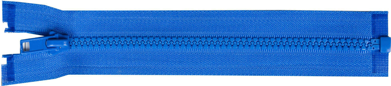
17. # 5 Vislon, Open End, Two Way with Auto Lock Slider